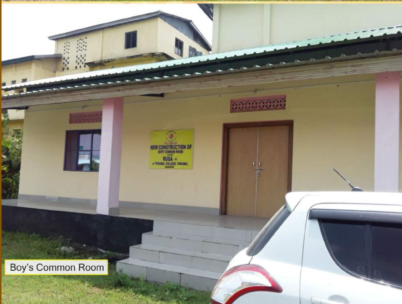
Boy's Common Room