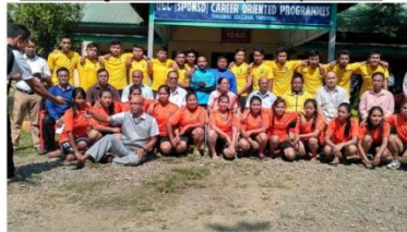
Thoubal College Kabaddi (M&W) Team won Team Champion at Manipur University Inter College Kabaddi Tournament 2017-18 held at Thoubal College, 26-28 Oct 2017.