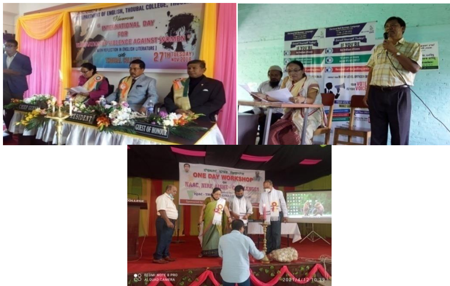
Workshop on violence against Women, National voters Day (2018) Workshop on NAAC,NIRF, AISHE Challenge persons