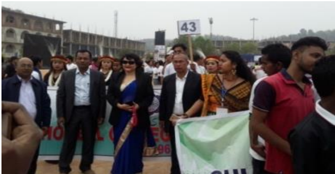
Thoubal College contingent participated Cultural march, Thoubal College Team participated cultural march pass in Manipur University.